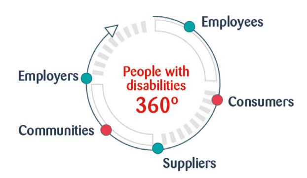
Figure 2: 360° approach of people with disabilities.

Fundación ONCE and the ILO Global Business and Disability Network