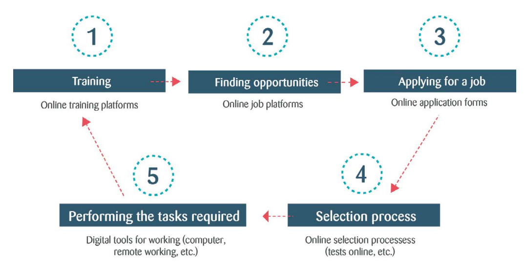
Figure 5: Digitalisation across the employee life-cycle.

As seen in previous chapters, digital tools are playing a central role across the employee lifecycle: from acquiring skills, finding job opportunities, applying for a job, participating in the selection process to performing the tasks required.