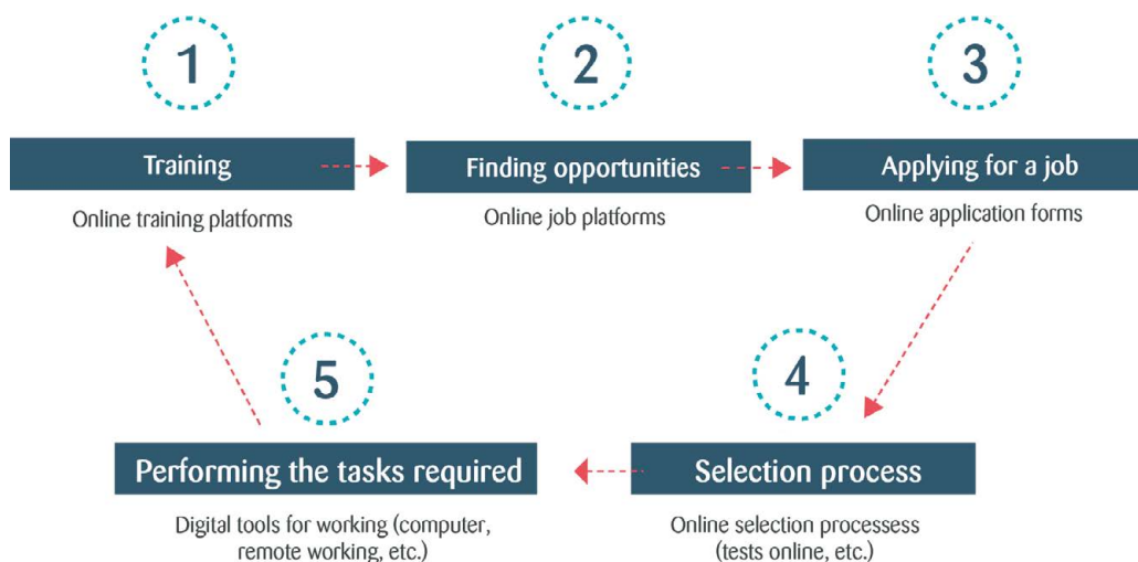
Figure 5: Digitalisation across the employee life-cycle.

As seen in previous chapters, digital tools are playing a central role across the employee lifecycle: from acquiring skills, finding job opportunities, applying for a job, participating in the selection process to performing the tasks required.