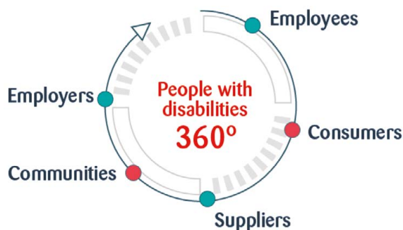
Figure 2: 360° approach of people with disabilities.